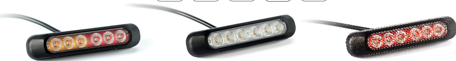
The smallest 3-function LED rear lamp in our offer!